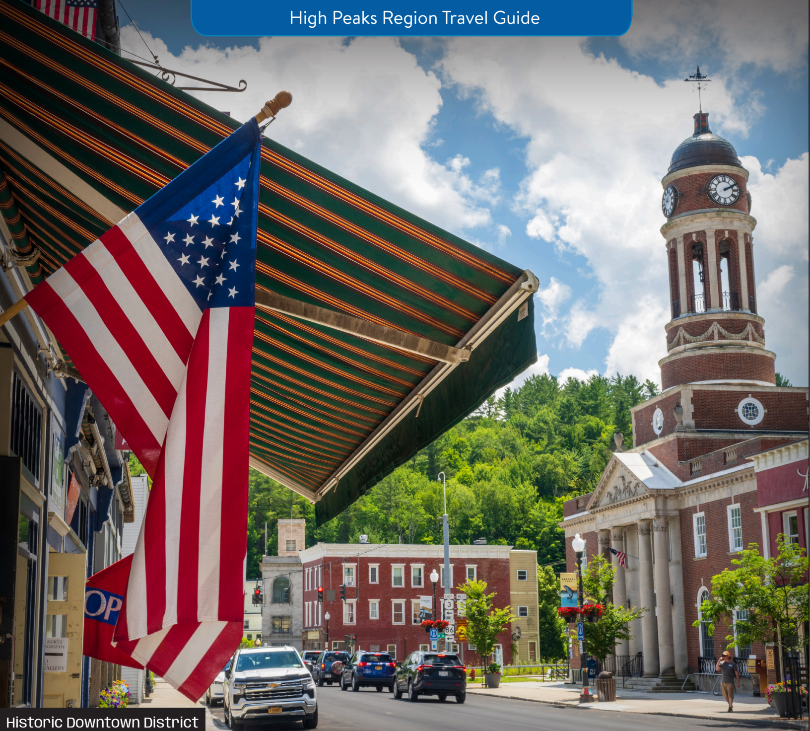
Historic Downtown District