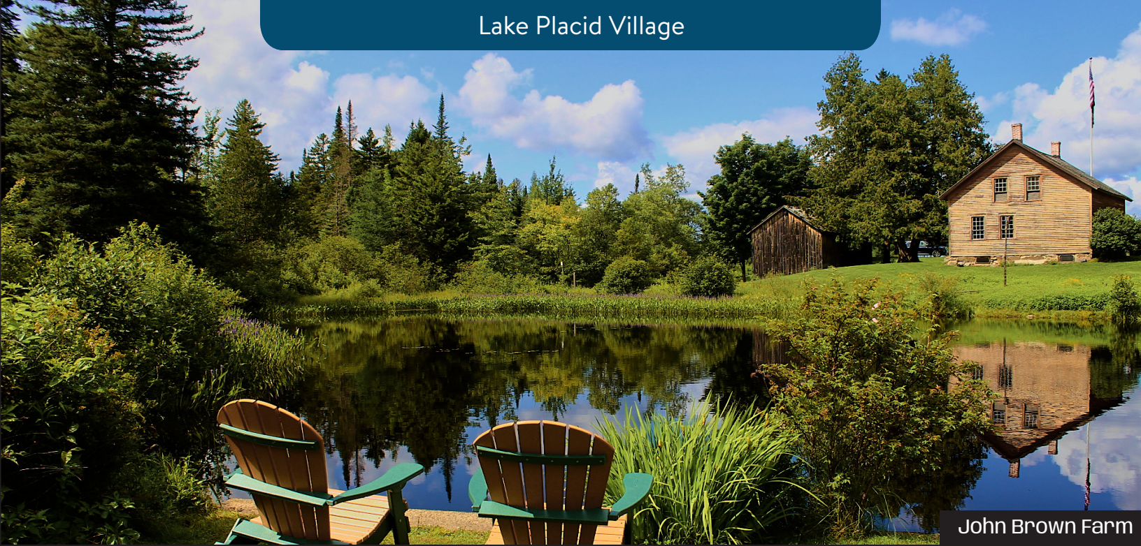
John Brown Farm