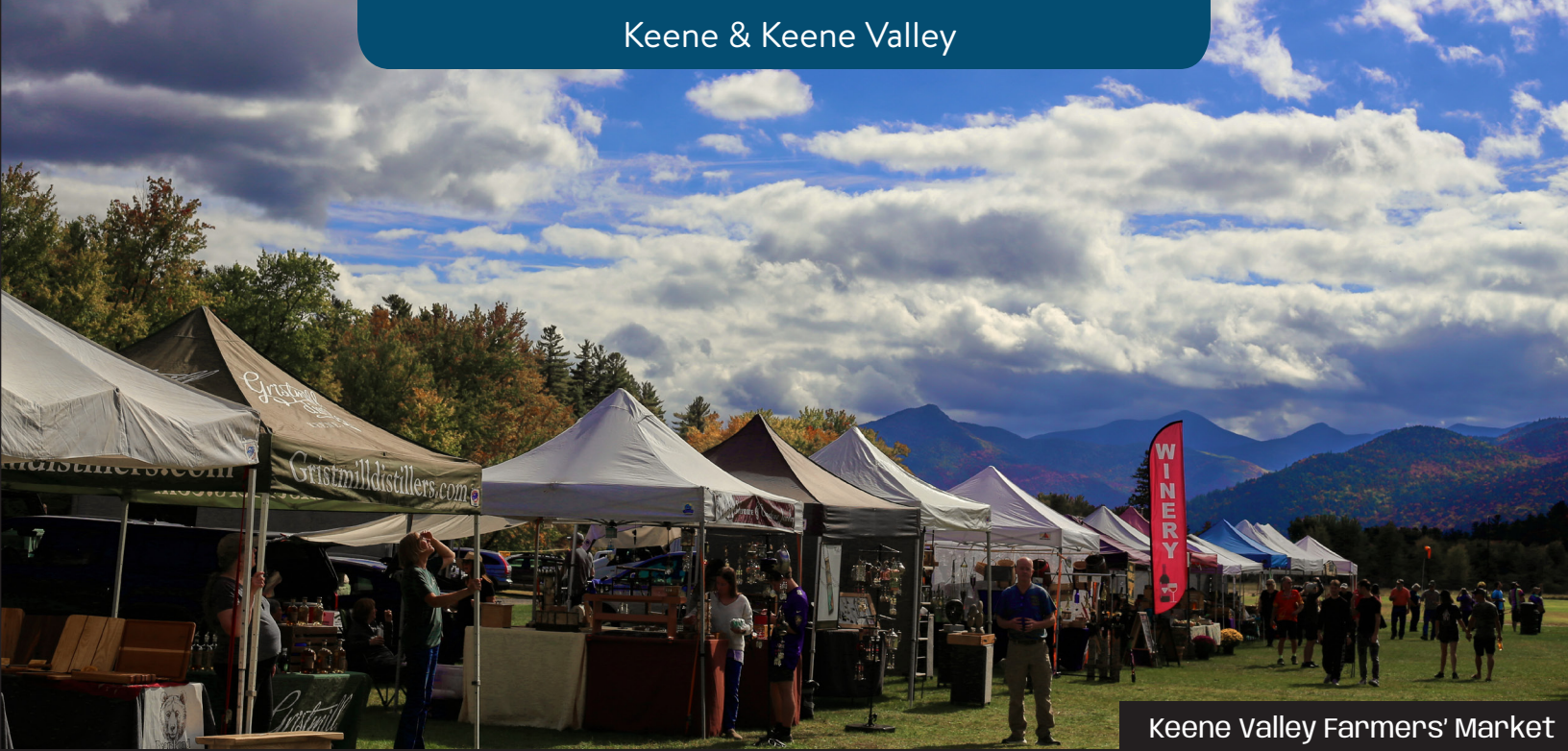
Keene Valley Farmers' Market